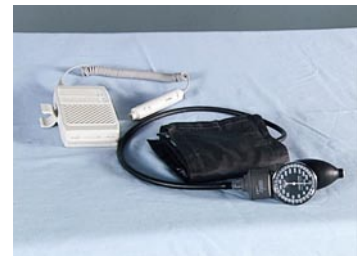
Figure 1. Equipment Used in the Measurement of an Ankle–Brachial Index.