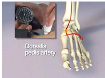
Figure 3. Measurement of the Systolic Pressure in the Dorsalis Pedis Artery.